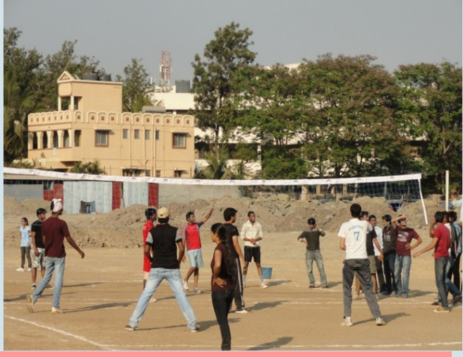
Students Playing Volley Ball during Techno Sports