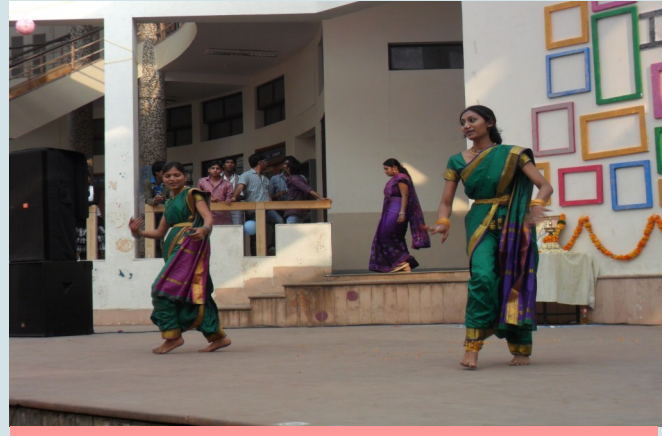
Students performing in Cultural Evening

This year students organized funny games along with outdoor games, which were really interesting and appreciated by students. On the last day of Techno-Sports final matches of cricket and volleyball were kept which were the most enjoyed matches, where all students were cheering their respective class to achieve a win.