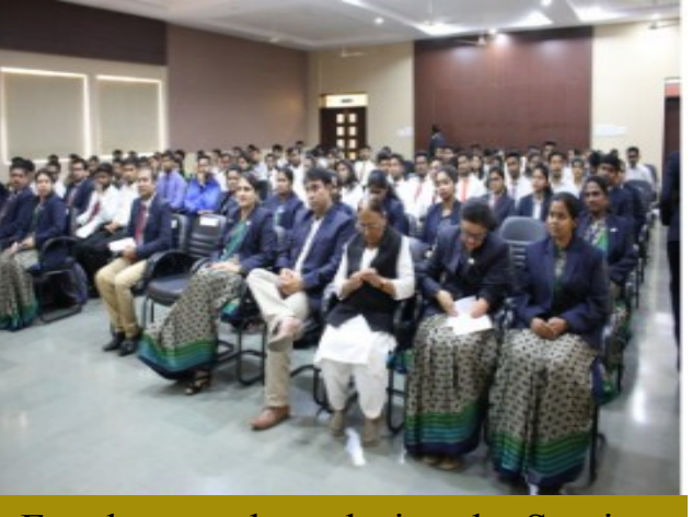
Faculty members during the Session