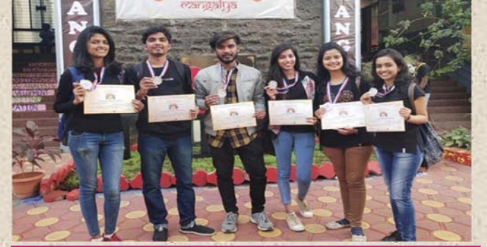
Students with certificate after winning Treasure Hunt

Student receiving prize for Treasure Hunt Event