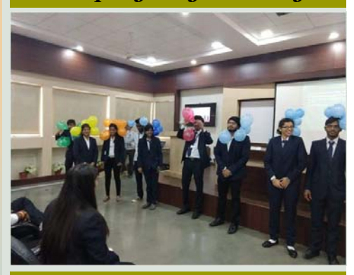
Students performing Activity