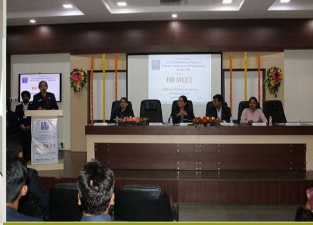
Dignitaries on the dias during HR Meet