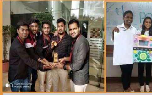
Students with winning Trophy and Posters

DYPIMCAM college promotes students to participate in inter collegiate activity. On 7-September , 2018 Students of DYPMBA participated in poster making competition organized by DPU Tathwade campus, these completion help students to work in groups and build team work.