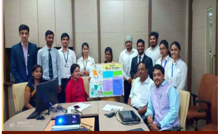
Students with Posters during Article writing competition

Students of DYPIMBA I year participated in article writing competition organized by Dr D Y Patil vidyapeeth's Institute of Distance Learning. Students prepared Article prepared poster for the competition. They won prize in the competition, which filled them with lot of joy enthusiasm and encouragement for further participation in the event.