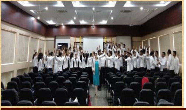
Students engrossed in activity