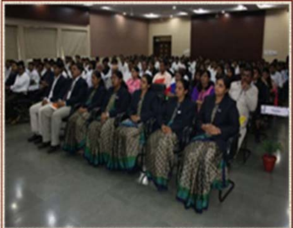
Faculty members and students attending Induction