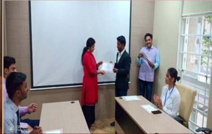
Student receiving certificate for Competition